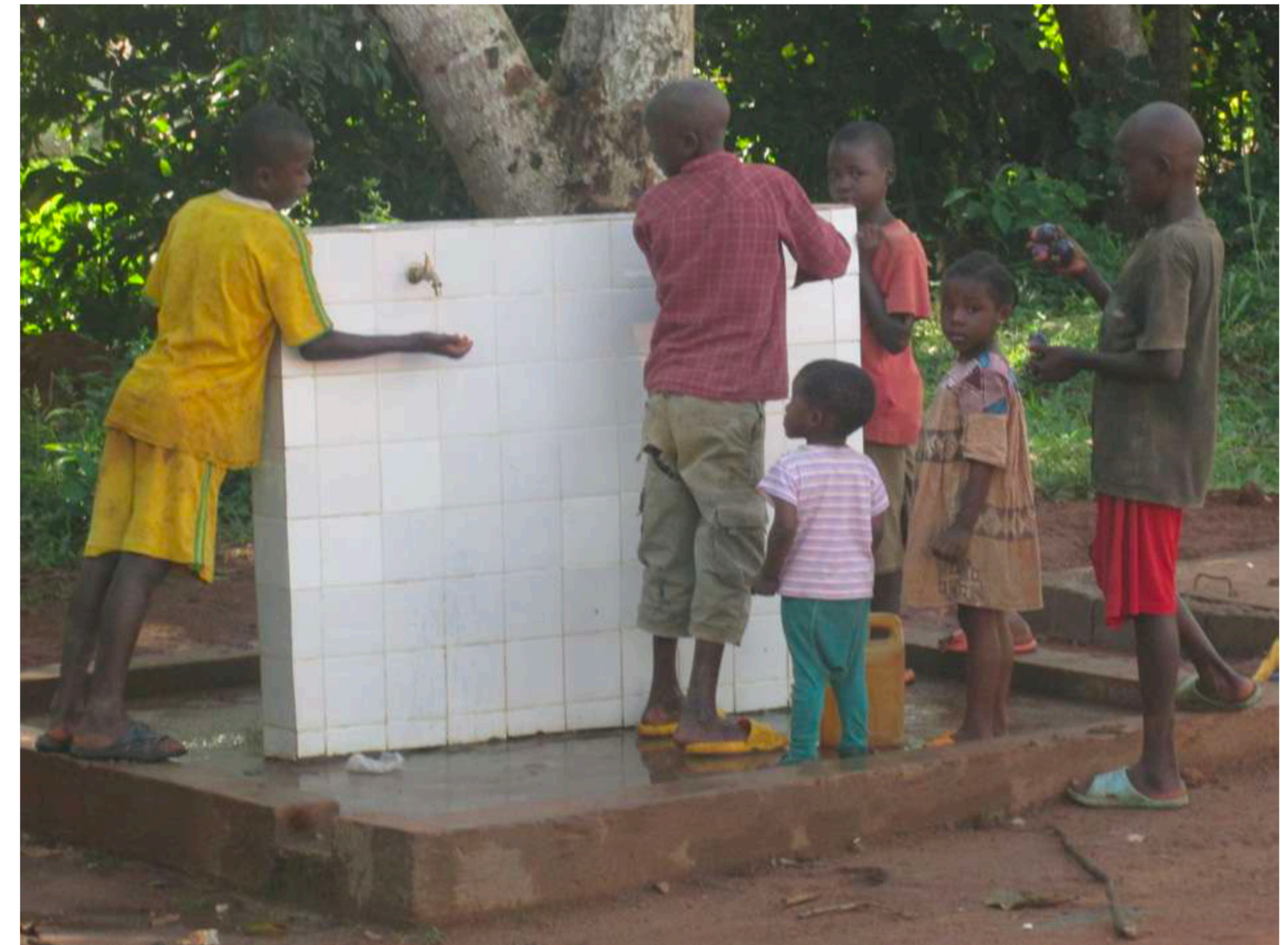
Picture 42. Such PB funded projects, essential for providing some drinking water to communities in longer dry seasons could be multiplied through Solidarity PBs for Climate Justice